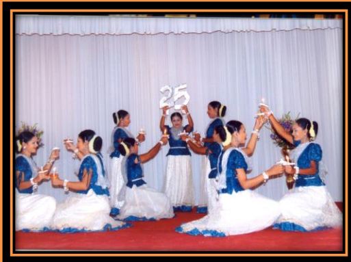
Carmel Fest 2010