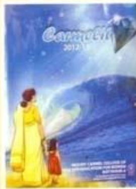
Carmelit 2012-2013 won the first prize in the All Kerala Inter Collegiate Magazine Competition held by St. John the Baptist's College of Education, Nedumkunnam.